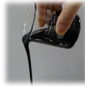
Low viscosity water dispersion