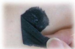
DC/J013 Black Peel Off Mask

DC/J013 Black Peel Off Mask DC/J014 Black Mask For Men DT/E504 Charcoal Purifying Micellar Lotion