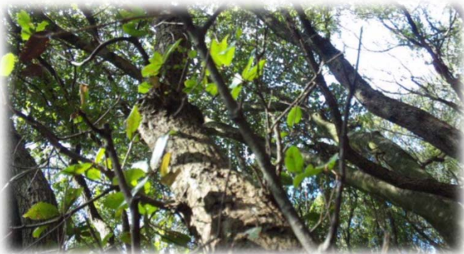
Charcoal powder from Japanese Oak tree