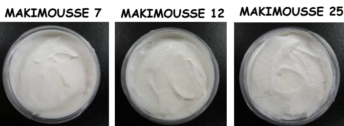
MAKIMOUSSE 7 Superior Smooth Cream

DS/077 O/W Sun Screen Cream/Mousse DS/080 O/W Sun Screen Cream SPF50+