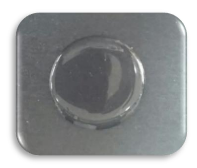
Appearance: Transparent liquid